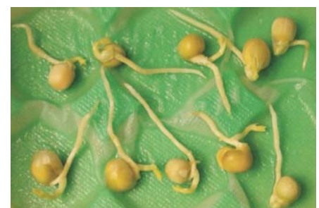
Fig. 3: Pea roots with treatment (20 min. heat, after 132 h germination)

remote effect of the device. Since it is immediately apparent that the basic affirmations, which had an obvious effect here, exerted a mental or immaterial effect on the growth of the pea roots, the basic postulate of natural science is refuted, namely that mind can have no effect on matter.”