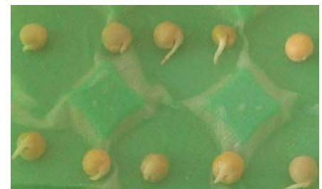
Fig. 2: Pea roots without treatment (20 min. heat, after 132 h germination)